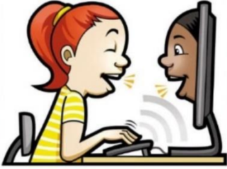
A Parent's Guide to Social Media